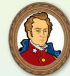
William B. Travis